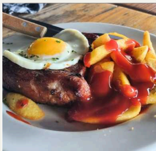
Steak, Egg & Chips